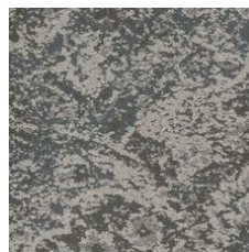
Heritage 85530 LRV 15.4