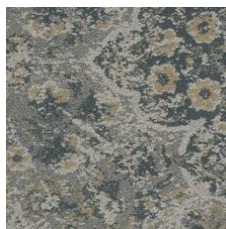
Classic 85496 LRV 23.6