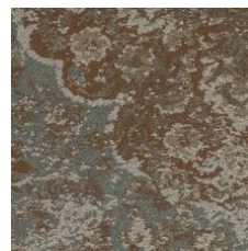
Nostalgic 85665 LRV 14.7