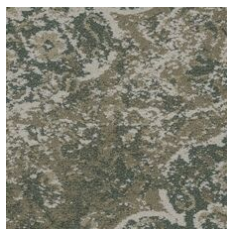
Recollect 85215 LRV 24.4