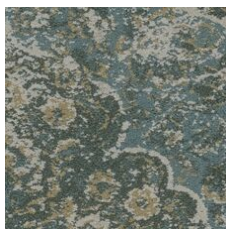
Novelty 85327 LRV 21.2