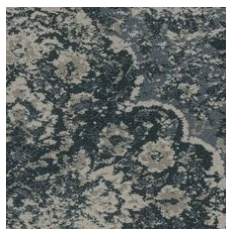
Timeless 85402 LRV 24.6